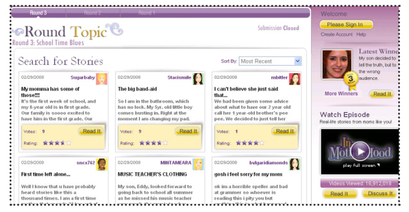
In The Motherhood

Unilever's In the Motherhood remains one of the industry's best known examples. Mindshare worked with the Suave brand team to produce short, online episodes featuring humorous stories of moms and their kids. The key to the program's success was that these filmed stories were real-life tales submitted by real moms, voted on by a